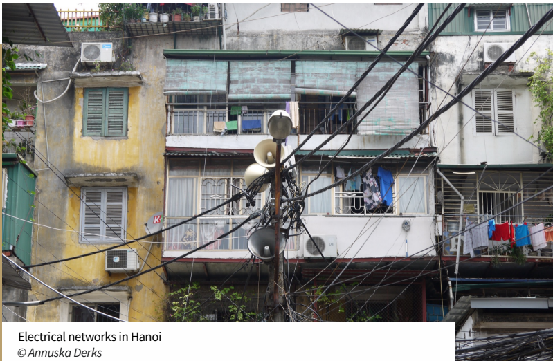
Electrical networks in Hanoi

Department of Social Anthropology and Cultural Studies, Department of Geography, Institute of Asian and Oriental Studies