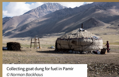
Collecting goat dung for fuel in Pamir